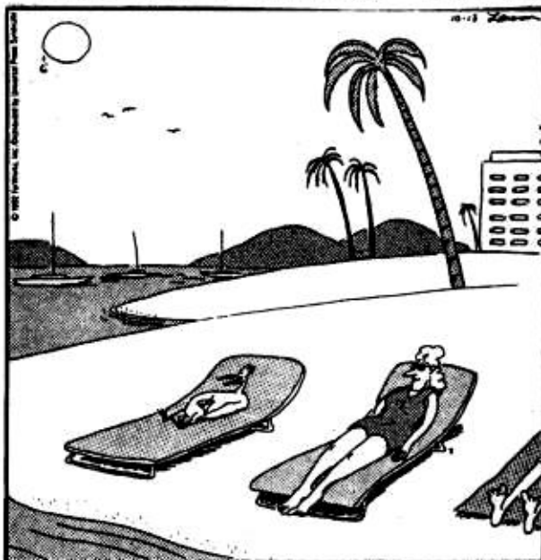
"Fools! They made me into a free-range chicken ... and man, I never looked back."

Culling is a continuous process, especially in view of our limited indoor facilities. I use what I call a "double fault" method, named after a problem I used to have while playing tennis. It may be described simply as eliminating those birds in which two or more undesirable AND inheritable traits are found to be present. For example, a Buff Ameraucana cockerel is found to have both stubs and excessive black in the tail. Or a Wheaten Ameraucana cockerel is observed to have a poorly shaped comb and a black wing-bay. Or a blue-wheaten pullet has a very small beard and a "pinched" tail carriage. You get the idea.